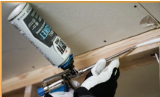
GREAT STUFF PRO™ Gasket