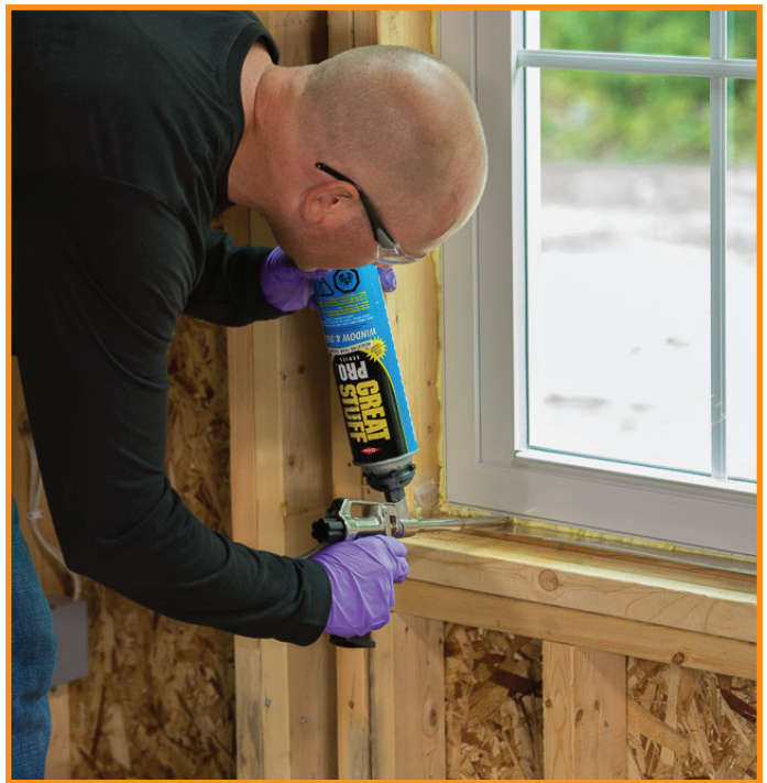
Window and their rough openings