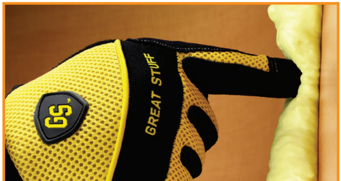
When cured, remains soft and flexible. Cured foam can be stuffed back into the gap without trimming.