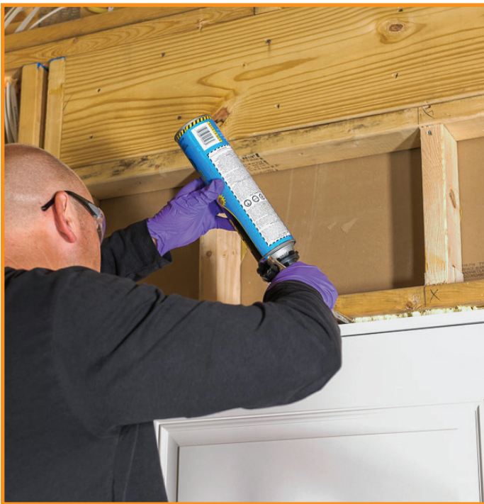
Doors and their rough openings