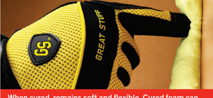
When cured, remains soft and flexible. Cured foam can be stuffed back into the gap without trimming.