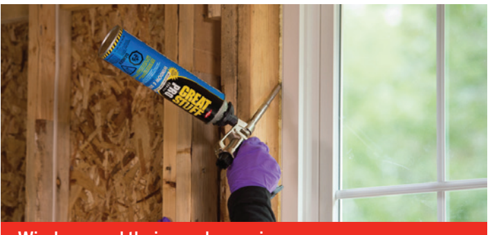
Windows and their rough openings

Use GREAT STUFF PRO™ Window & Door Insulating Foam Sealant to seal around windows and doors and their rough openings.