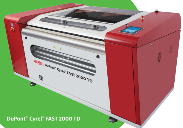
DuPont™ Cyrel® FAST 2000 TD

DuPont has over 1,500 thermal installations worldwide